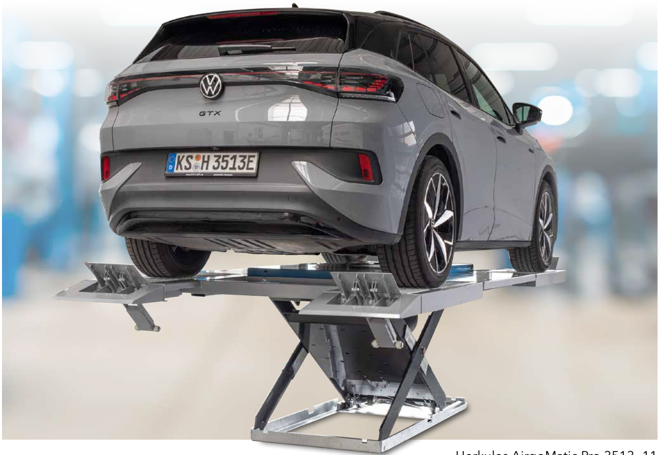
Herkules AirgoMatic Pro 3513 -11

Versatile lift for the workshop or the paint booth