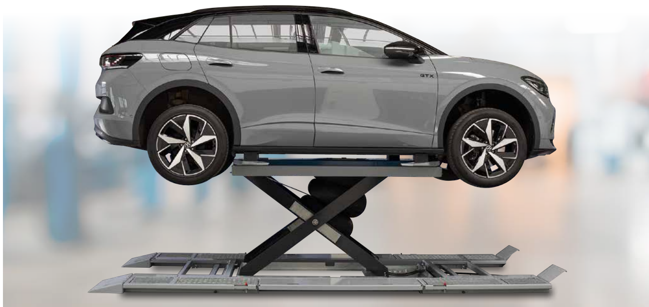
Herkules AirgoMatic Pro 3513 DUO-11

Many innovative details help simplify everyday work in the paint shop. Despite the compact design, which also characterizes the previous Herkules lifts, longer and heavier vehicles can also be lifted on the new AirgoMatic Pro 3513 thanks to intelligent roll-off protection and a lifting capacity of 3.5 t. New technology makes the DUO function safer and easier to use than ever before.