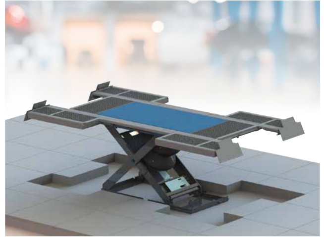
Herkules AirgoMatic Pro 3513-14 -Installation in spray booth