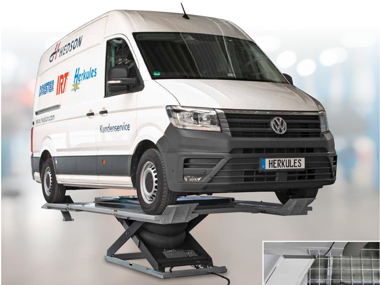
Herkules AirgoMatic Pro 3513 DUO-11 - even big vehicles can be lifted

Flexible lift for all requirements in the workshop and in the paint booth