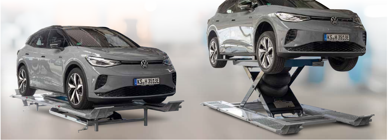
Herkules AirgoMatic Pro 3513 DUO-11