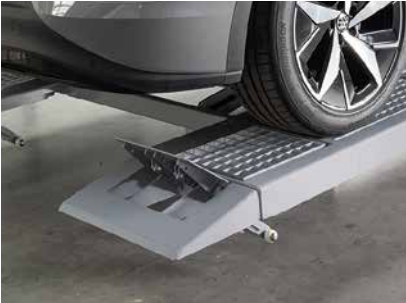
Innovative roll-off protection