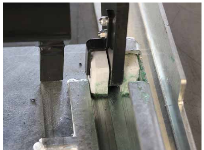
Herkules AirgoMatic Pro 3513-11 - stable and hardwearing due to double sliding blocks