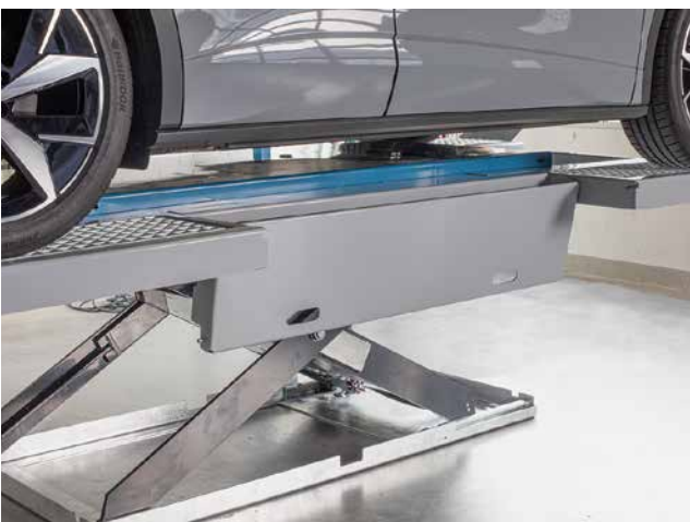
Herkules AirgoMatic Pro 3513-11 - easy access due to fold-down runways