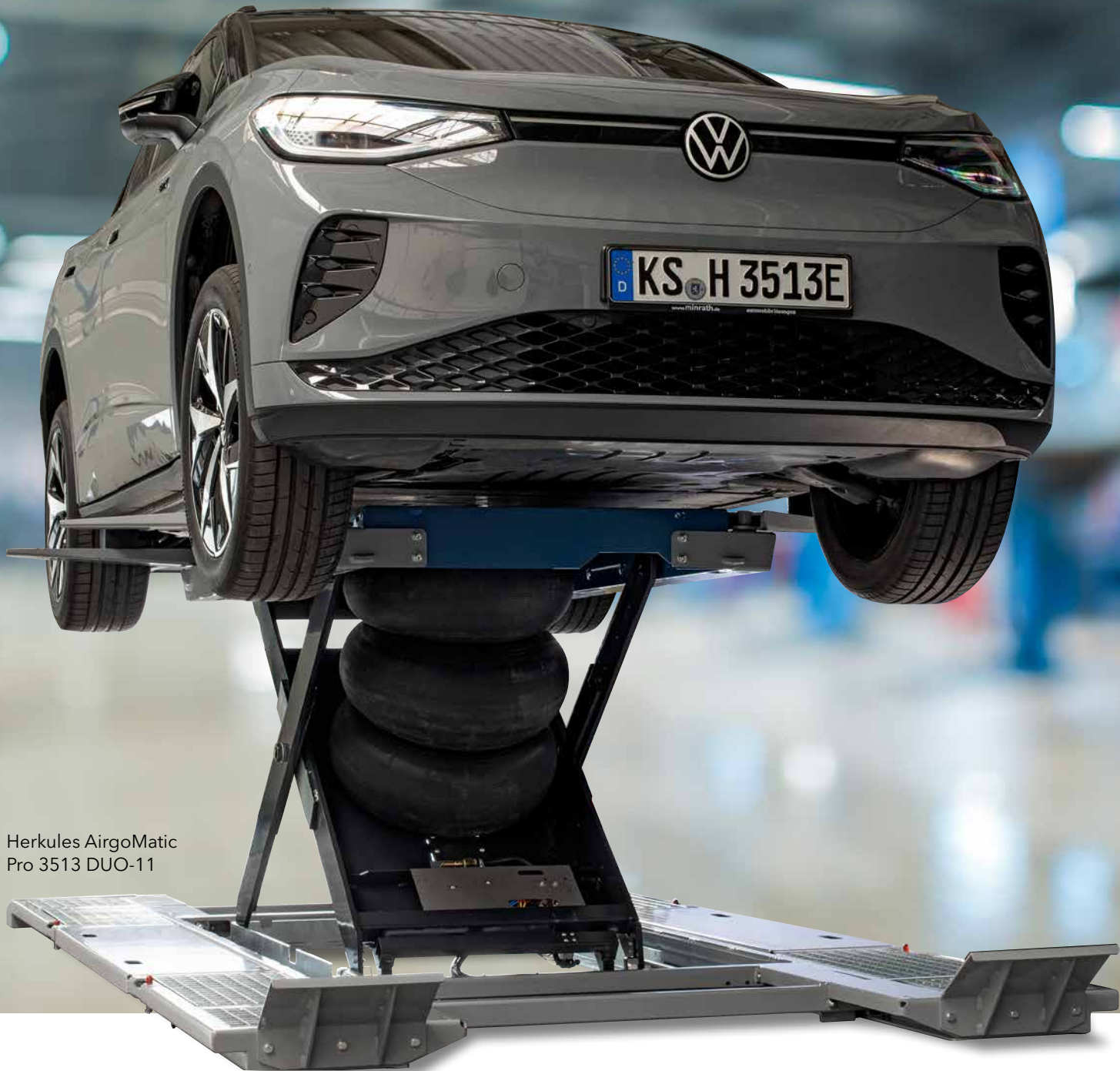
Herkules AirgoMatic Pro 3513 DUO-11

Powerful lift with innovative details for the body and paint shop