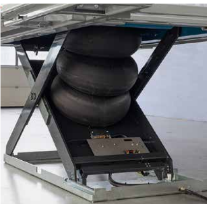
The core element of every pneumatic lift - the air-bellow