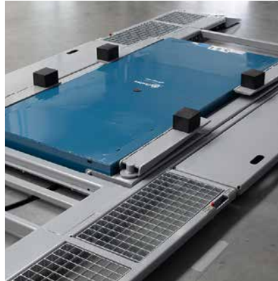
Extremely flat design