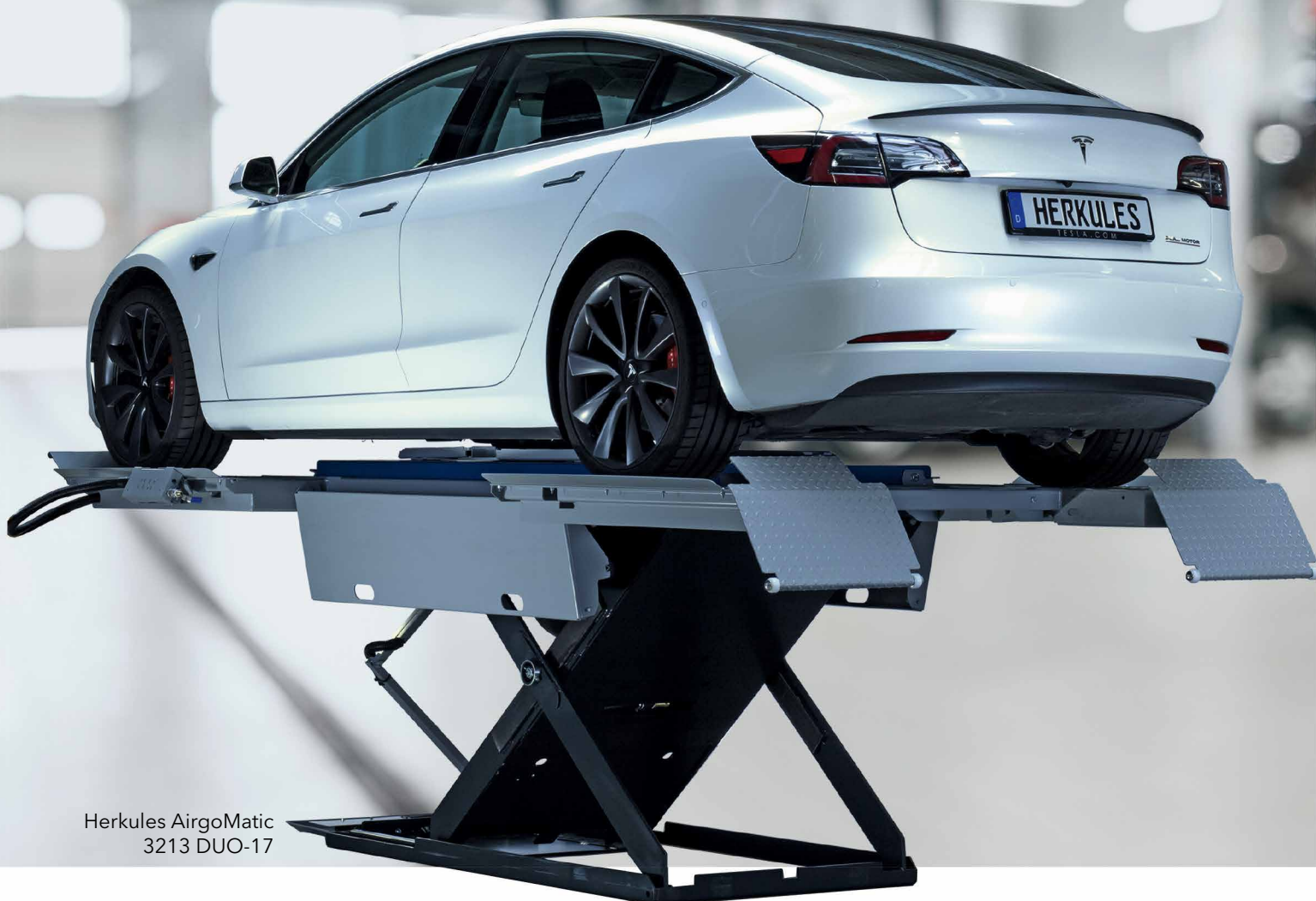
Herkules AirgoMatic 3213 DUO-17

A compact lift for different requirements in body- and paintshops