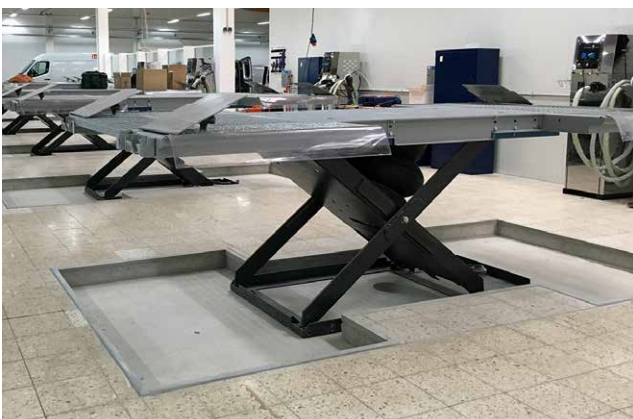
in concrete ...