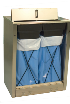
DRESTER WM-90-3 Two compartments for solid waste