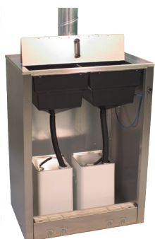
DRESTER WM-90-1 Two compartments for liquid waste