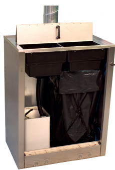
DRESTER WM-90-2 One compartment for liquid and one for solid waste