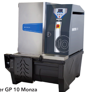
Drester GP 10 Monza