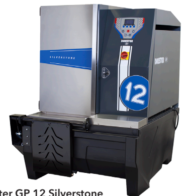
Drester GP 12 Silverstone

The GP 10 wheel washer has fixed flush pipes for rational and efficient cleaning, suitable for standard tyres.