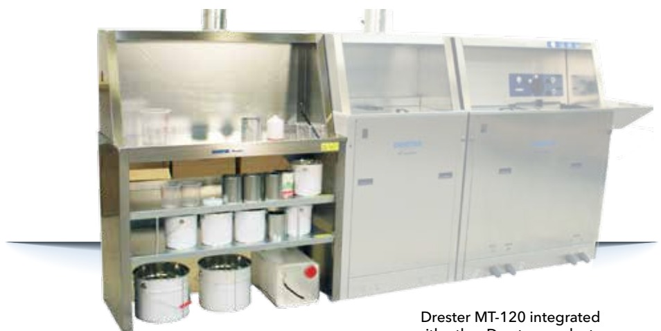
Drester MT-120 integrated with other Drester products