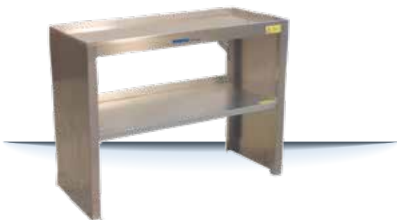
Drester MT-120, basic model