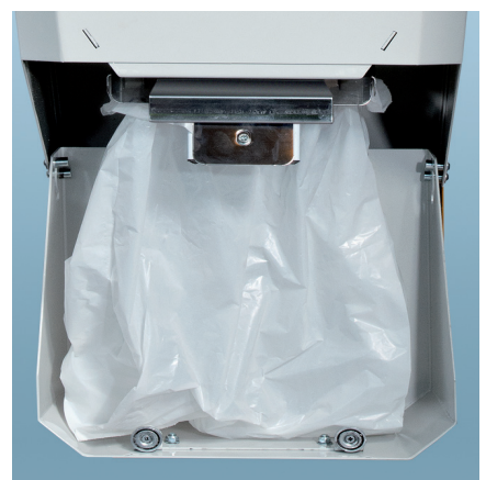
Dust-reduced disposal by opening the sliding plate. The dust goes into the dust bag.