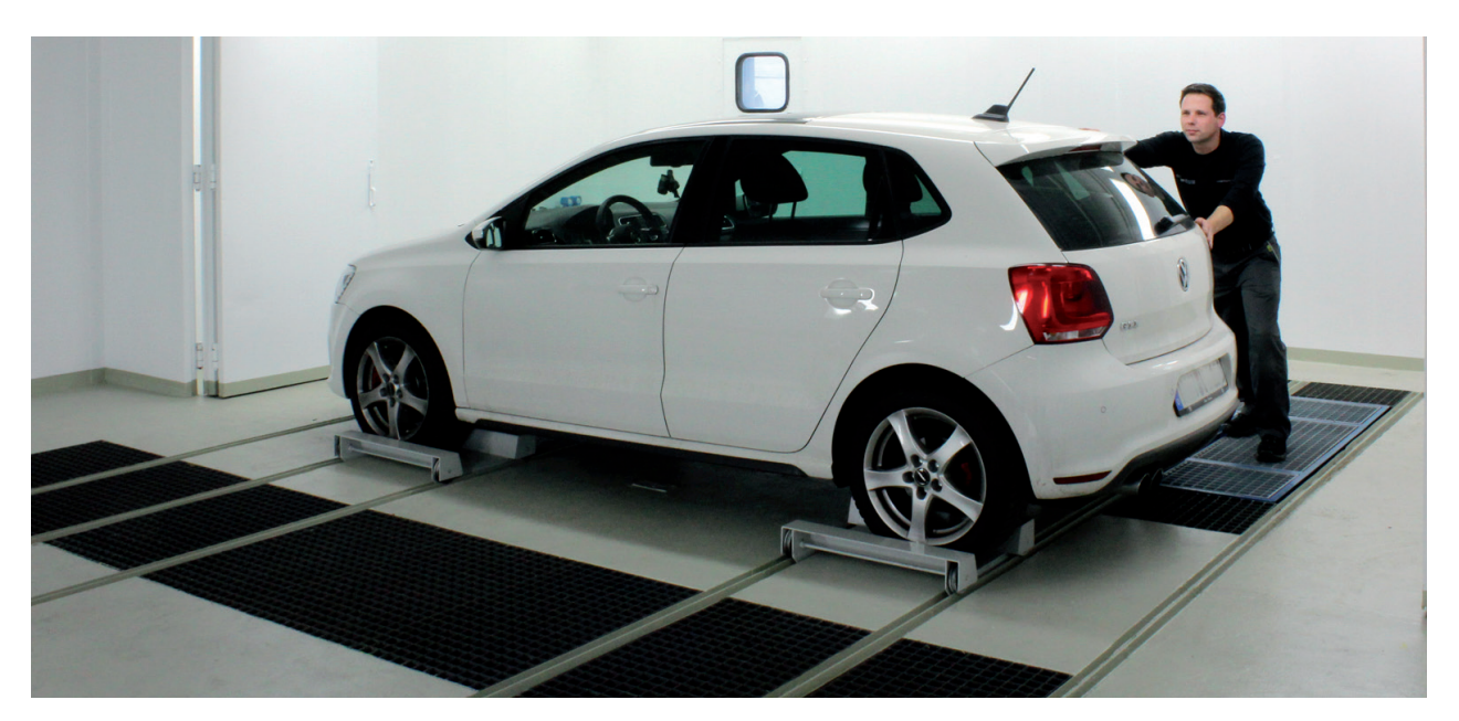
*Trolleys for railsystem not included