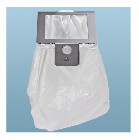
Ergonomic and dust-reduced dust disposal through a sliding plate and dust bag holders.