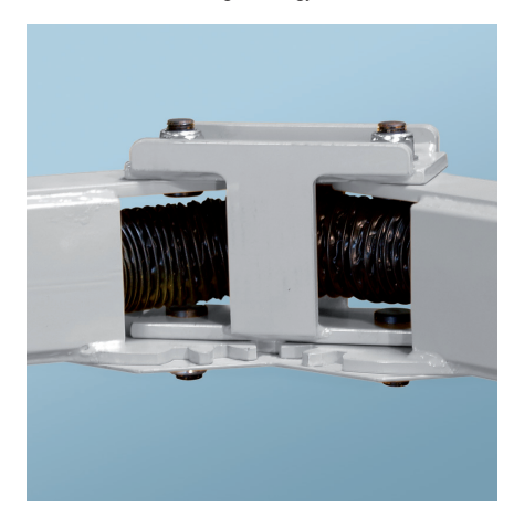
Safety guidance of the swivel arms through a smooth-running gear ring connection.