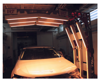
Speed = 20-200 cm/minute.