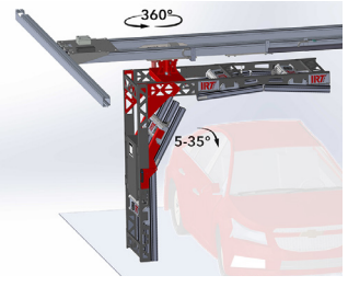
4 pyrometers, 1 pyrometer/zone. Complete control and full flexibility