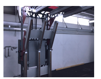
2 distance sensors, 1 measures hood and roof, 1 measures the side.